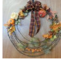
The Lady's of Energy made 2 wreaths, 1 for fall and 1 for Christmas, and donated them to the Festival of Trees